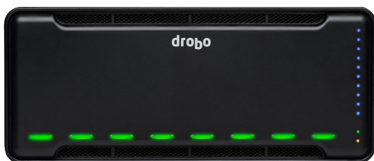
Drobo B800fs front (left) and back (right)